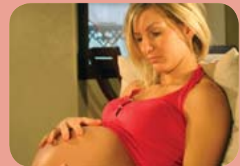
Figure 2 Concerns about the effect of diabetes on fertility or worries about the possibility of diabetes developing in offspring are issues that cause concern and should be discussed with a health care professional.