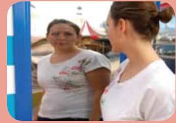
Figure 1 Self-image problems such as excess weight and other psychological issues such as depression, anxiety and worry can affect women's sexual well-being.